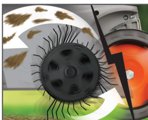
POWERFUL CYLINDER RAKE Powerful cylinder rake removes unwanted moss and thatch