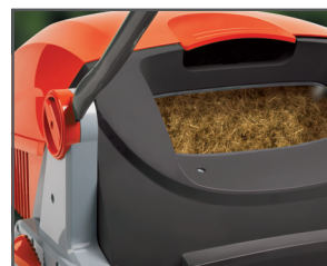
VISION WINDOW Vision Window – see when the collection box needs emptying.