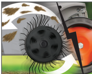
Powerful cylinder rake Powerful cylinder rake removes unwanted moss and thatch