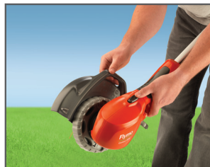
Simply convert Simply convert from trim to edge by twisting the cutting head