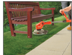
Shrubbing Trim difficult to access places