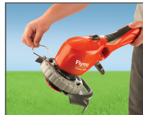
Plant Guard Easy to adjust tree and plant guard.